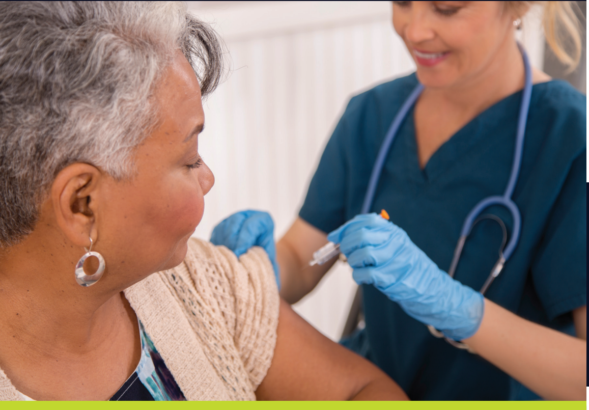
FLUAD® contains an adjuvant*

FLUAD® is an inactivated influenza virus vaccine against influenza subtypes A and B contained in the vaccine, indicated in adults 65 years of age and older.